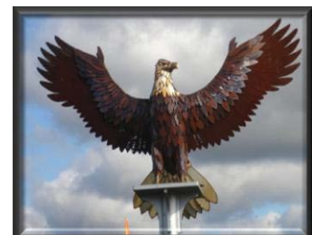
Hudsonville Public Schools Eagles

There are various recreational opportunities at the multiple Township and County parks, as well as at the Township Ice Center and Library. Jenison, Hudsonville and Grandville Public Schools, as well as numerous private schools, provide progressive educational opportunities. Churches of many faiths and congregations are also located within the Township.