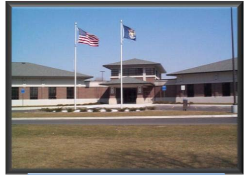
Georgetown Township Office

Welcome and thanks for exploring the possibility of locating your business in Georgetown Township! If you are considering either starting up or relocating a business within Georgetown Township, or even expanding an existing business, please use the following as an information source to help get you started and on your way. The Township website is also a great resource for information that may be helpful.