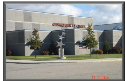
Georgetown Ice Center

Georgetown Township is a zoned community which means that provisions have been adopted and are enforced to promote and safeguard the public health, safety and general welfare of the people and businesses of the Township. The provisions are intended to regulate the use of land, buildings and structures to insure their location in appropriate areas, to reduce hazards to life and property, and to provide for orderly development within the Township. Simply speaking, zoning is the tool used by the Township to balance the rights of the individual property owner or property dweller with the rights of the community for the benefit of those who reside or conduct business within the boundaries.