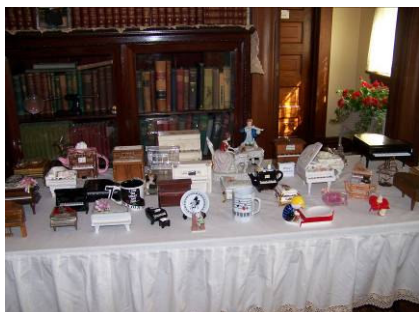
Music boxes on display at the recent open house featuring "Music to my Ears"